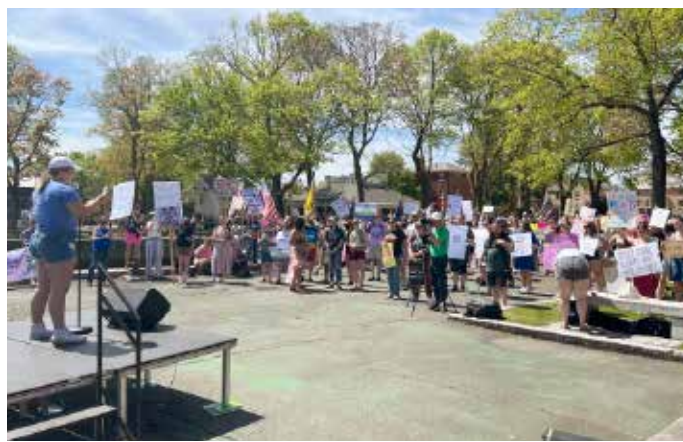
On May 14th, we organized a "Bans Off Our Bodies" rally with a team of allies that drew hundreds in Portsmouth.

NHWF has long been a pro-choice organization, and we are responding to the federal and state attack on reproductive freedom through continued advocacy and expanded grantmaking, including our recently-launched Reproductive and Sexual Health Care Access Fund , which we launched with an initial grant to the Reproductive Freedom Fund of New Hampshire, our state's abortion fund. The Fund will support continued work to ensure access to all reproductive and sexual health care, including abortion care, in New Hampshire. (More on this Fund on the next page!)